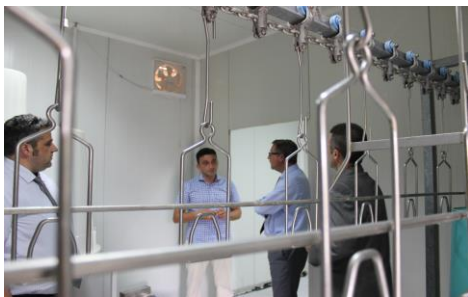
Aves-Prom owner shows USAID Mission Director around the broiler slaughterhouse

Through specific activities and interventions, USAID's EMPOWER Private Sector supports Kosovo businesses grow and create new jobs. North Kosovo residents are one of the four priority population groups that EMPOWER Private Sector targets, to promote their full inclusion in the country's economic development.