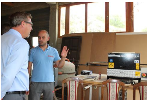
Owner of Godži talks to USAID Mission Director about his business expansion plans