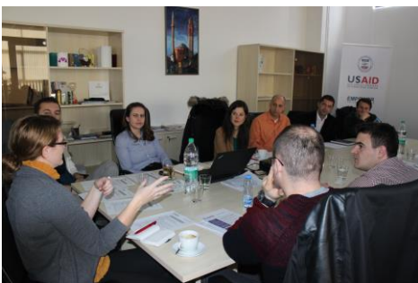
Discussion on alternative energy sources

This February, the first cohort of Females in IT (FIT) program received the certificates of successful completion of the program. During a period of 18 months, these 48 participants went through extensive training in three distinct job profiles: Desktop Support Technician, System & Network Administration and Software & Application Developers. The objective of the project was the professional advancement of the participants in order to ease their transition into the ICT labor market. So far, 30 project participants have become part of the labor force, while 10 have successfully finished their internship. The second generation of FIT will be certified in May 2016.