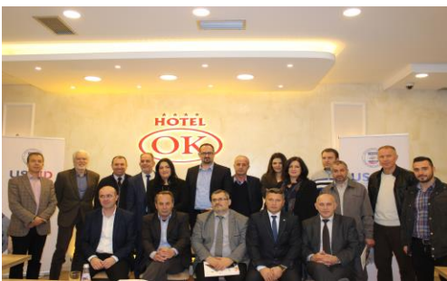
The VETLC Prizren Members

"The VETLC is the address where businesses can raise issues. With a clear vision, it will proactively serve as a key link between schools and businesses, something that did not exist before"