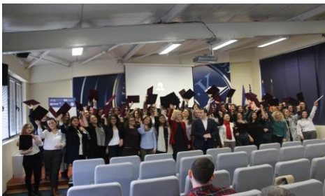
More young women have joined the ICT labor market

Made in Kosovo App #EcShlirë helps users report sexual harassment instances as they occur. Reports are directly sent to the authorities, whereas data collected are visualized on interactive maps to mark areas where such instances occur. The app is developed by 30 young women trained in mobile app development by Girls Coding Kosovo, and is an example how young women can acquire skills in technology that will help them find jobs, and how digital technology can be used to address social issues such as reporting sexual harassment, thus help make streets safer for everyone. Speaking at the launching ceremony, Brian Fahey, USAID Kosovo Senior Economic Advisor said programs like this “tap into the resources of young women and help them realize their potential and talent”.