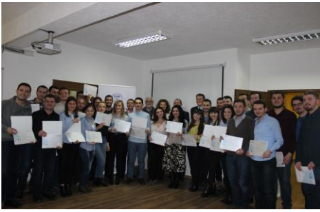
Thirty-nine youth certified in ICT profiles