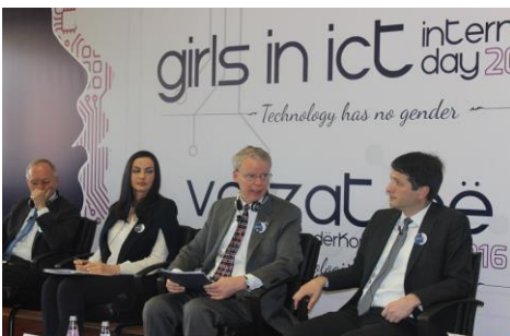
Marking Girls in ICT Day in Kosovo, 2016

Currently in Kosovo, the employee gender structure in ICT sector is 80% male and 20% female, which is the same proportion as in the non-ICT sector. ("ICT Skills Gap Analysis", November 2013, STIKK). We need more women in technology in this era of innovation!