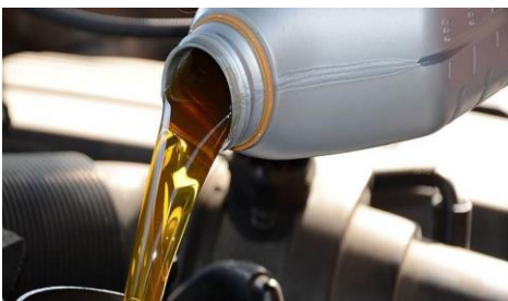
BTP Holding is currently the only used motor oil recycler in Kosovo

Exposure to foreign markets, newest technology and establishment of networks was the focus of five Kosovo metal processors visit to the International Wire and Cable Trade Fair and the International Tube and Pipe Trade Fair, two of the largest bi-annual industry shows held in Düsseldorf, Germany, in the first week of April. The visiting companies Fiberglass Kosova, IMP-K, Nallbani, Rroni Fer, and Shkodra met with at least 100 other visitors, and identified some concrete cooperation opportunities.