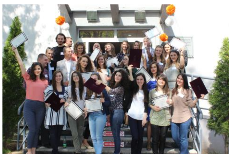
Last group of 20 completed Females in IT Program